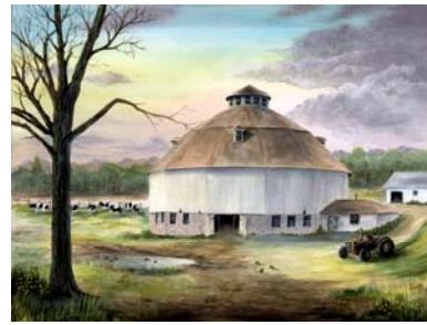
After the Storm