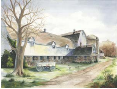
Days Gone By