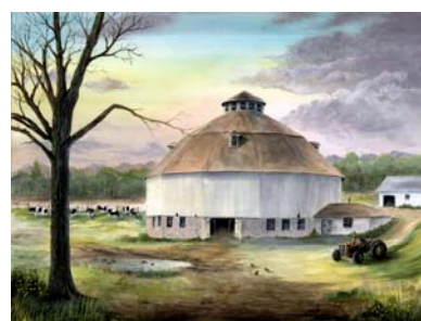
After the Storm