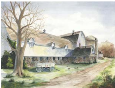
Days Gone By